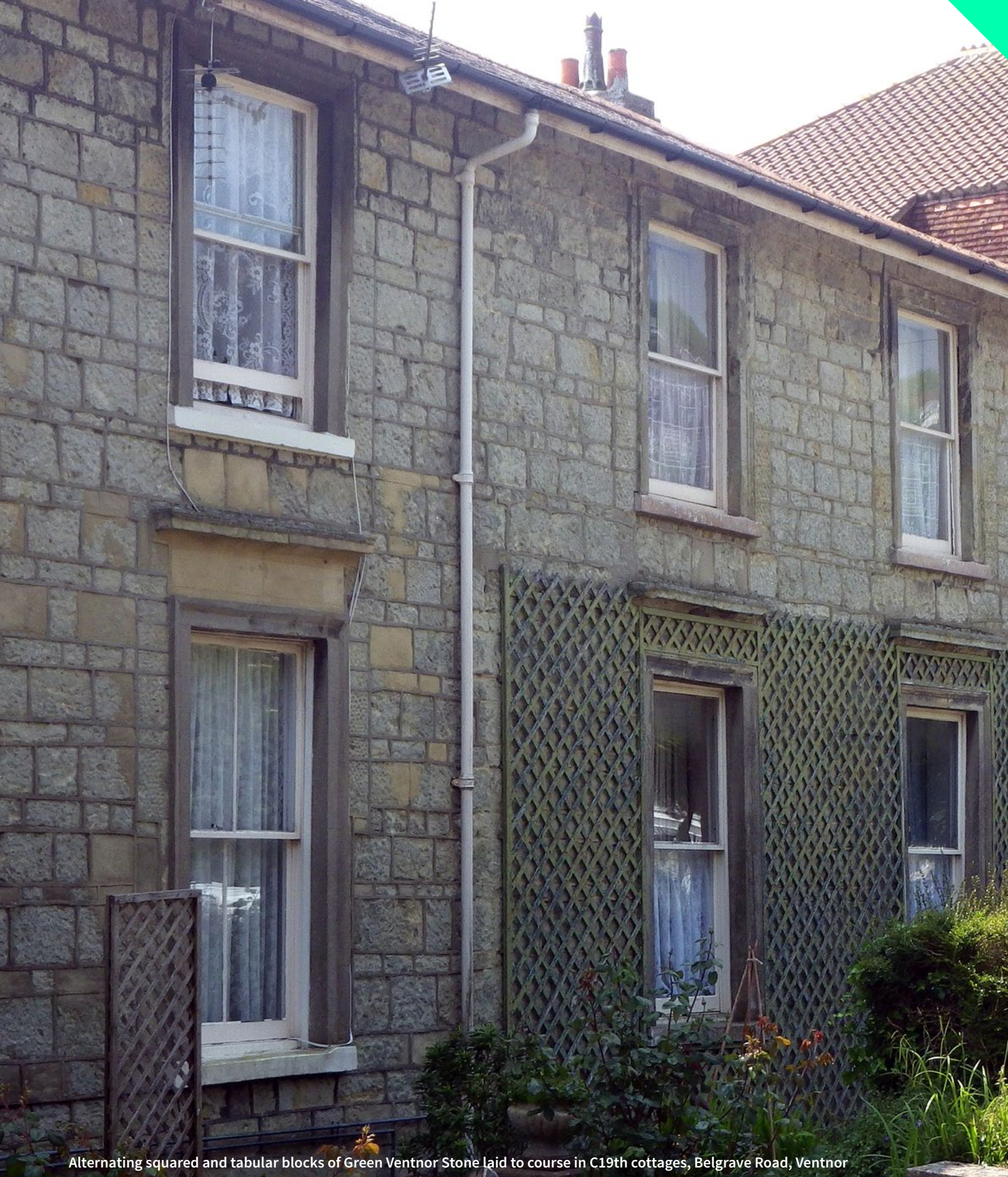
Alternating squared and tabular blocks of Green Ventnor Stone laid to course in C19th cottages, Belgrave Road, Ventnor