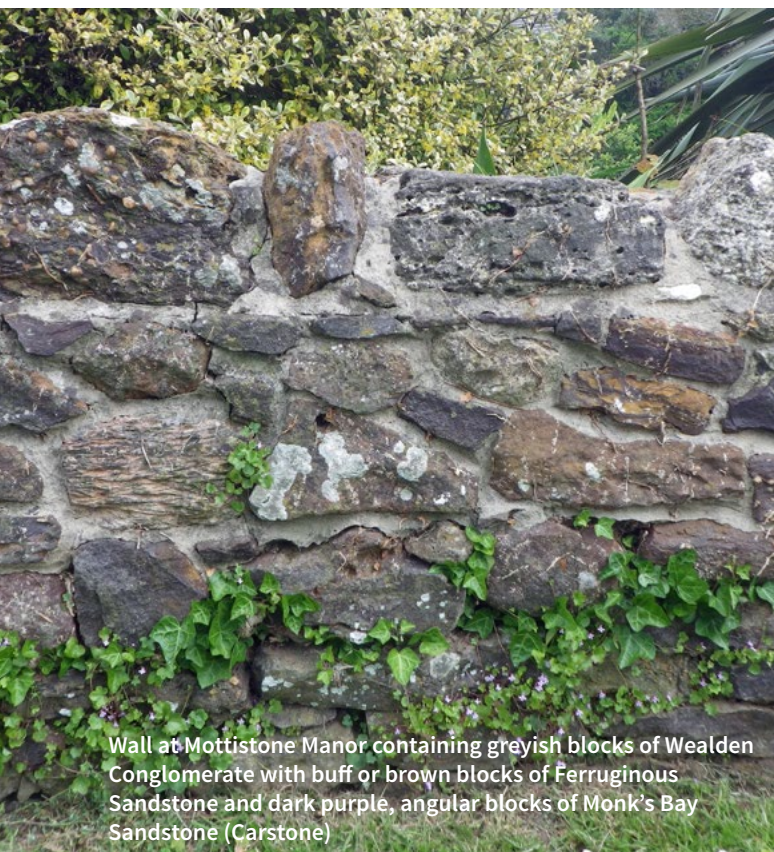
Wall at Mottistone Manor containing greyish blocks of Wealden Conglomerate with buff or brown blocks of Ferruginous Sandstone and dark purple, angular blocks of Monk's Bay Sandstone (Carstone)

The limestones are moderately hard, resistant and durable and have provided a local source of rubblestone for building and decorative purposes in the villages of Brook, Mottistone, Brighstone and Yafford. Some of the limestone slabs have also been used as paving stones in the Sandown area.