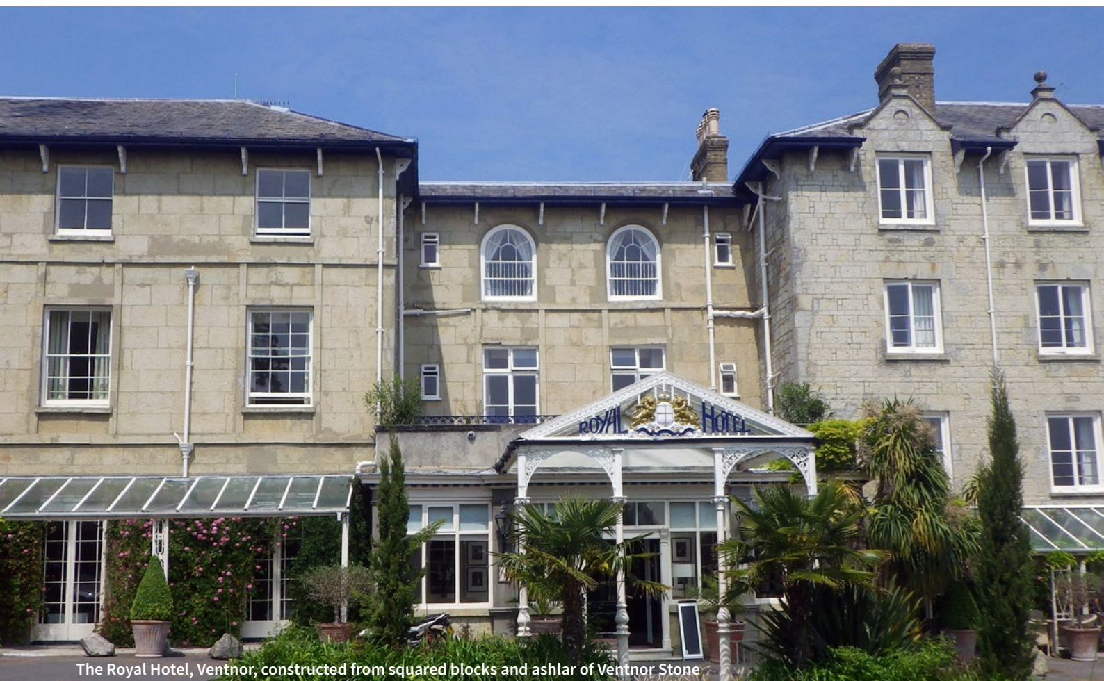
The Royal Hotel, Ventnor, constructed from squared blocks and ashlar of Ventnor Stone

Ventnor Stone is an important building stone in Ventnor and is very widely used in many of the older and prestigious buildings and other structures in the town. It is a very homogeneous stone and readily cuts into quality ashlar or more roughly dressed squared blocks. Poorer quality rounded or irregular blocks of Ventnor Stone are often used in boundary walls in association with flint or chert nodules or other locally derived stones.