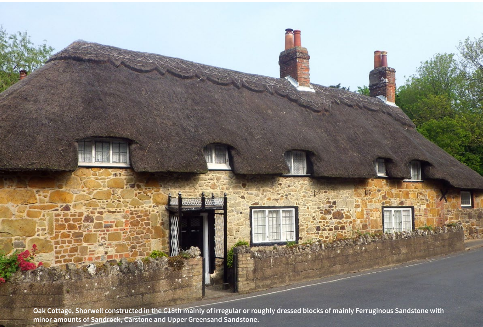
Oak Cottage, Shorwell constructed in the C18th mainly of irregular or roughly dressed blocks of mainly Ferruginous Sandstone with minor amounts of Sandrock, Carstone and Upper Greensand Sandstone.

Sandrock occurs in two areas in the south of the Isle of Wight: in a generally narrow, sigmoidal outcrop extending from Compton Bay (in the west) to Culver Cliff (in the east) and in a wider outcrop around the northern margin of the Southern Downs from Chale Bay (in the west) to Shanklin Chine (in the east).