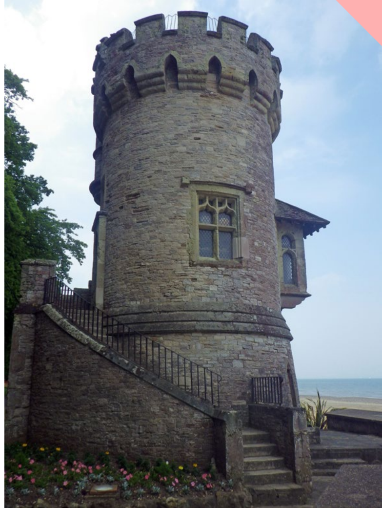
Appley Tower, Ryde, constructed in the C19th of coursed rubblestone with ashlar dressings. Various stones were used including a range of Palaeogene limestones (including Nettlestone Sandstone, Featherstone and Bembridge Limestone) with Upper Greensand Sandstone with occasional blocks of Monk's Bay Sandstone (Carstone)

used as a local building stone, mainly as tabular blocks or rubblestone in walls, especially in Seaview and Ryde. Some beds readily split into layers and it has also occasionally been employed as a roofing 'slate'.