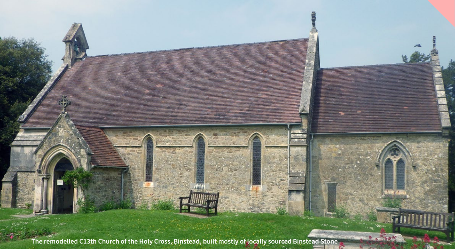
The remodelled C13th Church of the Holy Cross, Binstead, built mostly of locally sourced Binstead Stone

in association with coursed Flint nodules in Calbourne and as quoins in association with sandstone blocks from the Ferruginous Sands Formation at Shorwell.