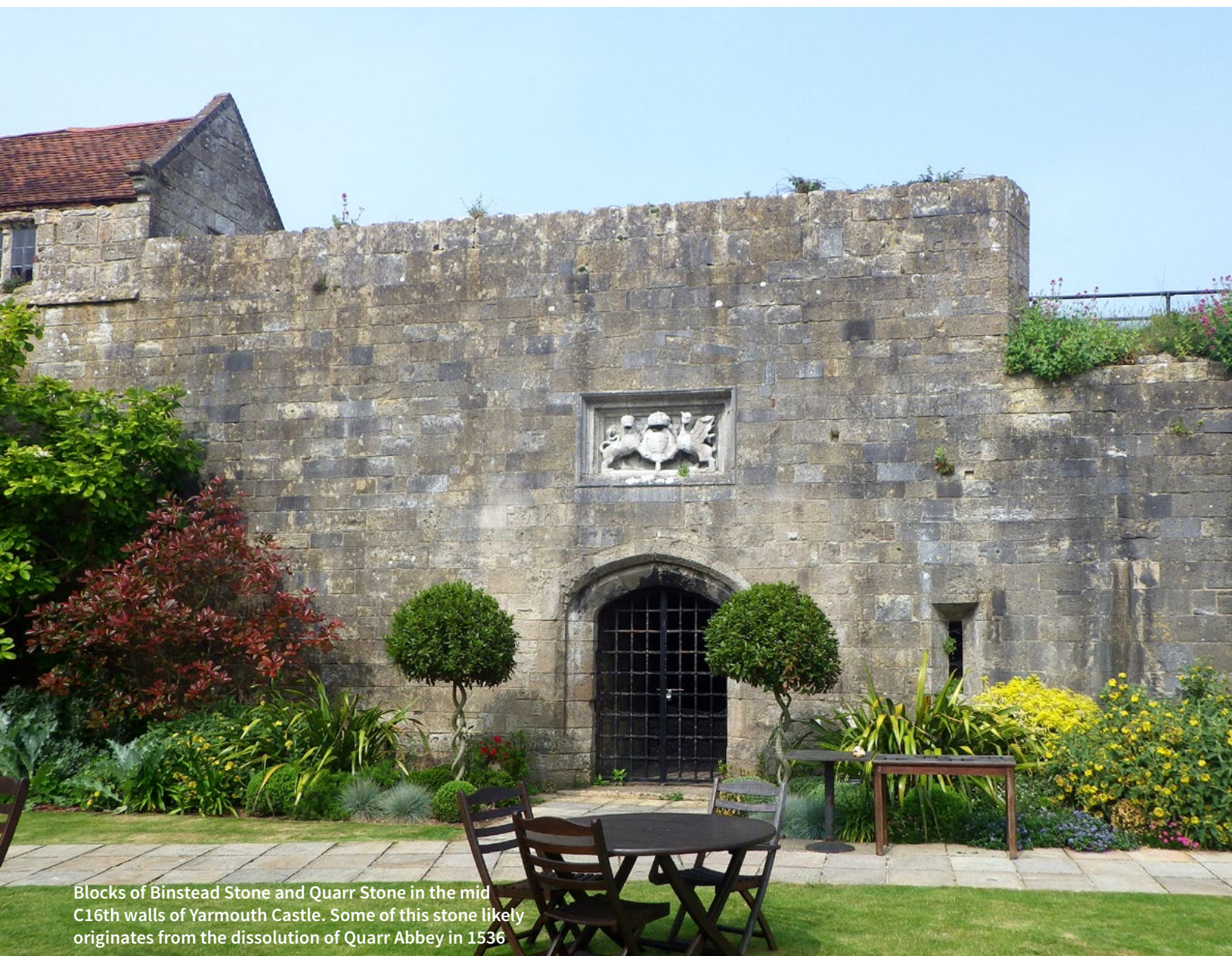
Blocks of Binstead Stone and Quarr Stone in the mid C16th walls of Yarmouth Castle. Some of this stone likely originates from the dissolution of Quarr Abbey in 1536

It should be noted, however, that the use of Quarr Stone on the Isle of Wight was relatively minor when compared with the large amounts of this stone that were exported for use on the mainland.