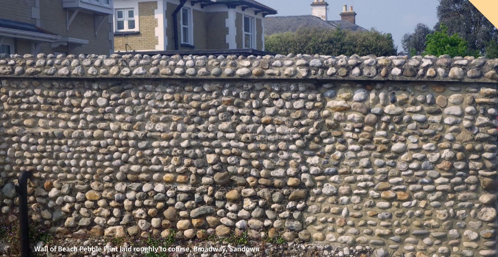
Wall of Beach Pebble Flint laid roughly to course, Broadway, Sandown

for walling; pebbles and cobbles were hand-picked and sorted for size and laid to course, with the long axis oriented horizontally, vertically or at an inclined angle (thereby creating an imbricate pattern).