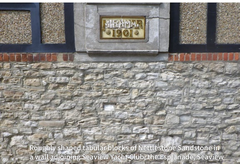
Roughly shaped tabular blocks of Nettlestone Sandstone in a wall adjoining Seaview Yacht Club, the Esplanade, Seaview

Nettlestone Sandstone is moderately resistant and has been