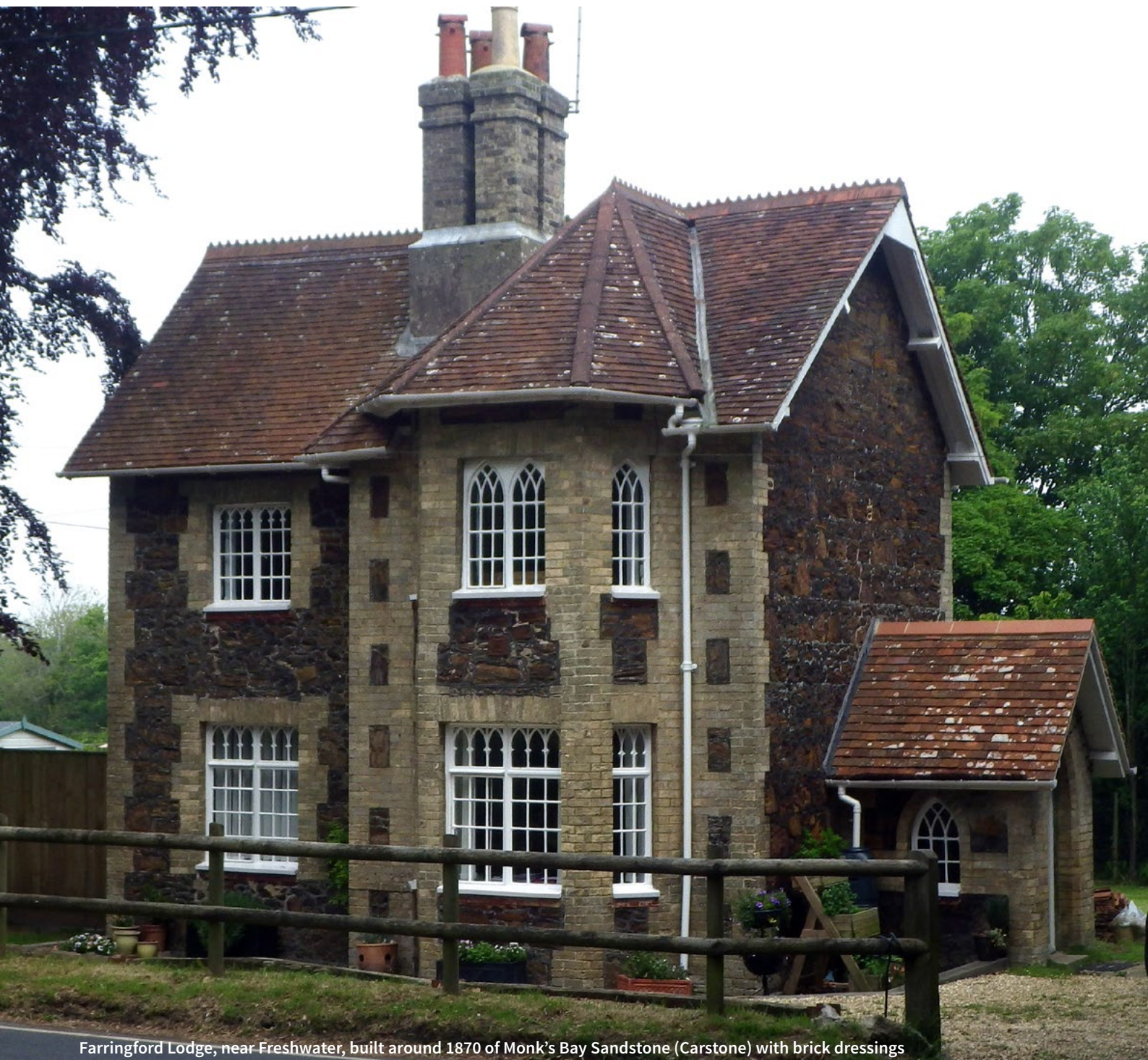
Farringford Lodge, near Freshwater, built around 1870 of Monk's Bay Sandstone (Carstone) with brick dressings

The distinctive dark brown, purple-brown or red-brown variegated Monk's Bay Sandstone (formerly called Carstone or Ironstone) is readily identified wherever it occurs in the southern part of the Isle of Wight. Apart from always being highly ferruginous, the sandstone varies lithologically from a coarse-grained, weakly consolidated quartz-rich sandstone ('grit') to a more fine-grained, often pebbly, sandstone and ironstone towards the top of the formation. The thickness varies north-eastwards across the Isle from 2 m up to nearly 22 m.