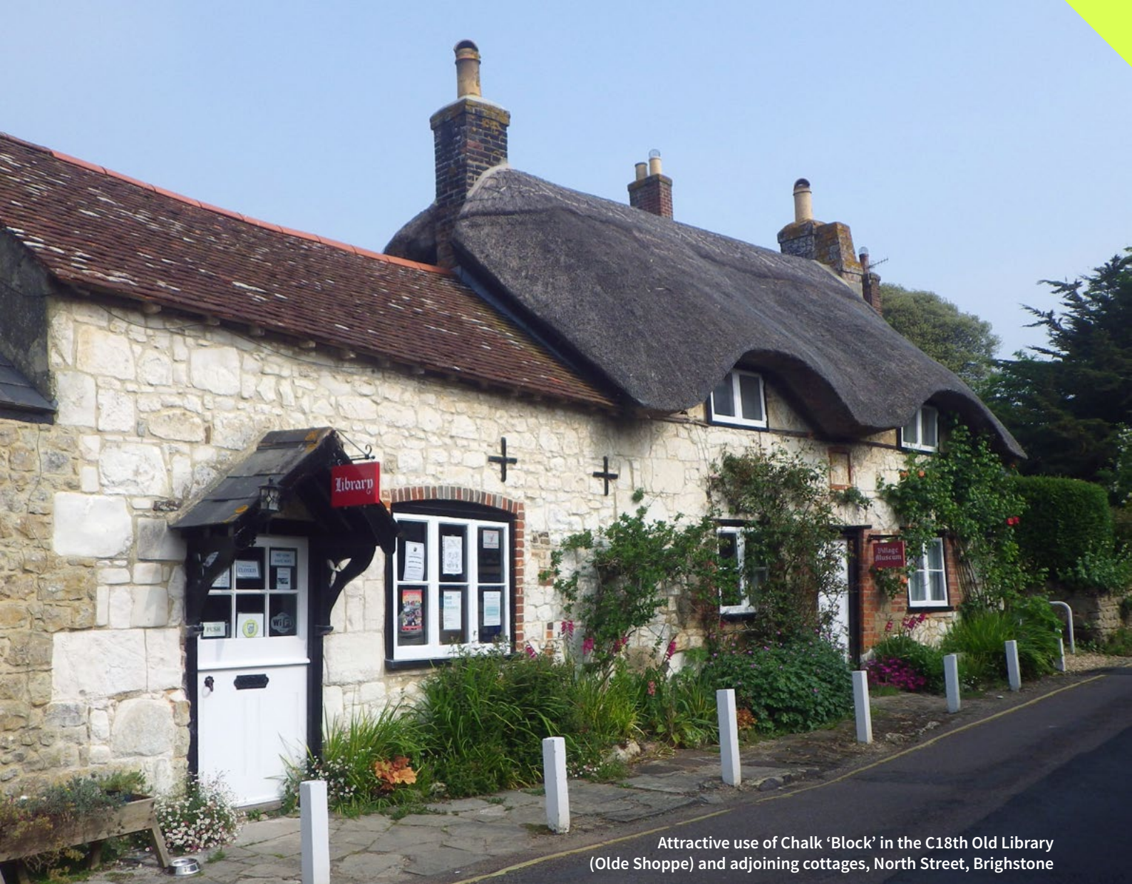
Attractive use of Chalk 'Block' in the C18th Old Library (Olde Shoppe) and adjoining cottages, North Street, Brighstone