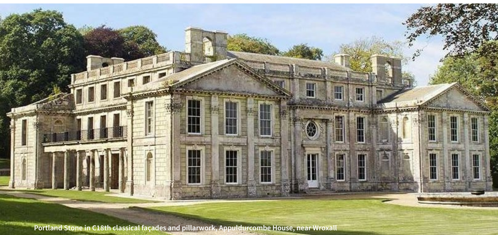
Portland Stone in C18th classical façades and pillarwork, Appuldurcombe House, near Wroxall

Further descriptions of the Isle of Wight’s imported building stones can be found in several of the references listed in the Further Reading section of this Atlas.