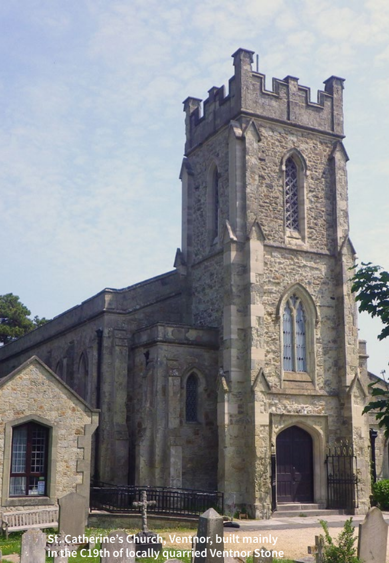
St. Catherine's Church, Ventnor, built mainly in the C19th of locally quarried Ventnor Stone