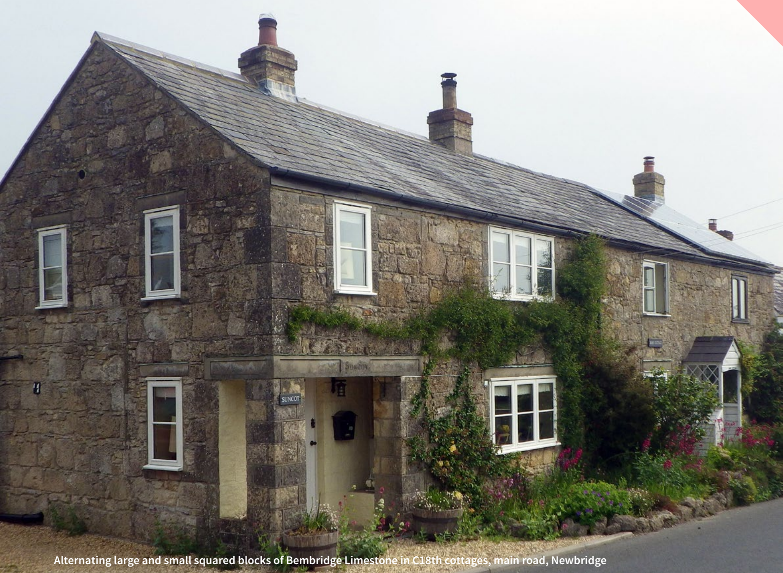
Alternating large and small squared blocks of Bembridge Limestone in C18th cottages, main road, Newbridge