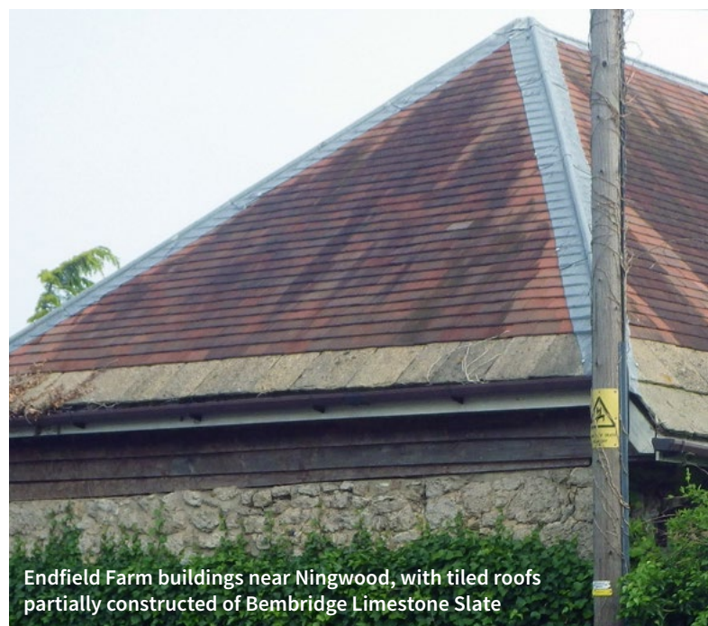
Endfield Farm buildings near Ningwood, with tiled roofs partially constructed of Bembridge Limestone Slate

stone with few structures other than traces of lamination and contains a similar fossil assemblage to, albeit less prolific than that of Bembridge Limestone. The thinly-bedded, slabby, relatively hard and durable nature of Bembridge Limestone Slate has enabled it to be used as a source of roofing 'slate' on the Isle. Archaeological studies have confirmed that several Roman villas used this stone for roofing. Occasionally, more modern buildings, such as farm building at Endfield Farm near Ningwood, also employ this stone type for this purpose.