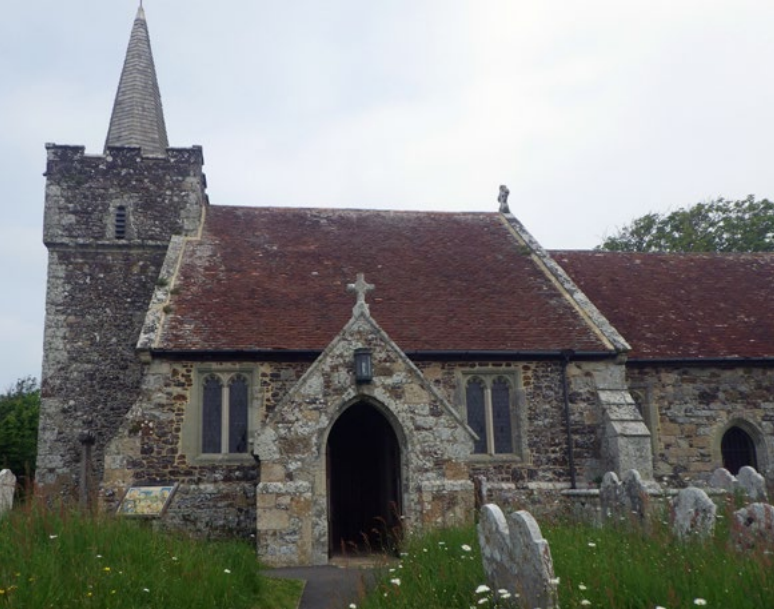
Mottistone Church, built in the C12th and restored in 1863, is built mainly of a mixture of dark Monk's Bay Sandstone (Carstone) and paler Upper Greensand Sandstone.

Sandstones from this formation are, once again, of variable quality; some are poorly-cemented, fine-grained sands which weather easily and do not make good building stone. More durable, harder, better-cemented sandstone beds also occur in the formation and these produce good quality building stones which are used locally, but extensively, in a number of small towns and villages throughout the outcrop area.