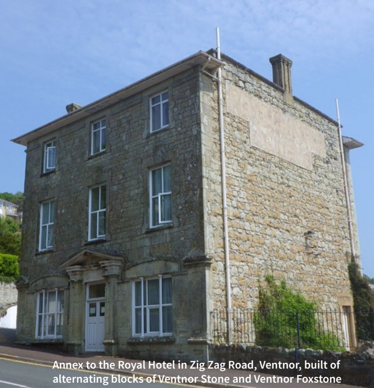
Annex to the Royal Hotel in Zig Zag Road, Ventnor, built of alternating blocks of Ventnor Stone and Ventnor Foxstone