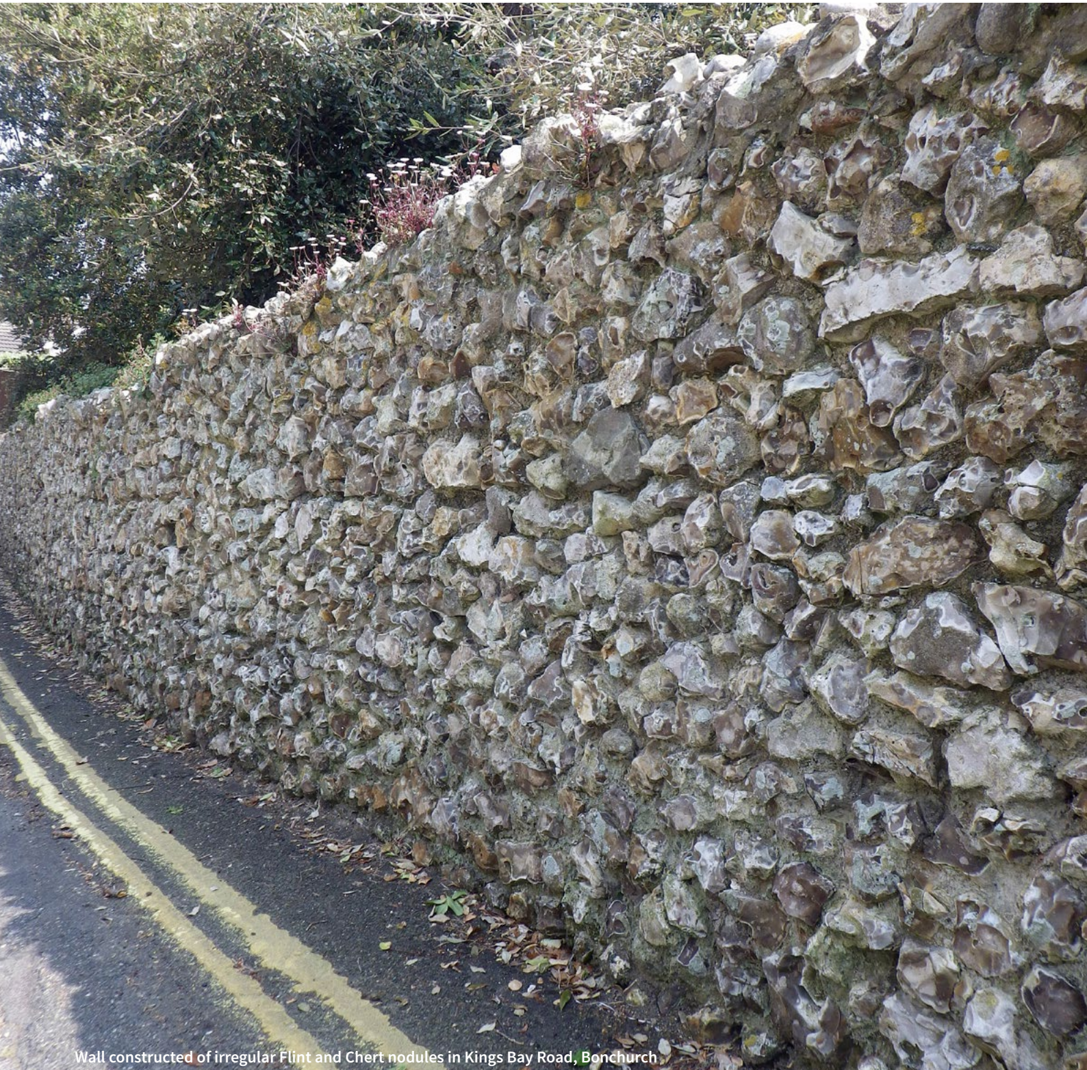
Wall constructed of irregular Flint and Chert nodules in Kings Bay Road, Bonchurch

Due to its hardness and the irregular manner in which it breaks, Chert is a difficult stone to work. Larger blocks tend to be used close to outcrop, where they are often employed as irregular, angular capping stones on walls which themselves are either constructed of smaller Chert nodules or Upper Greensand Sandstone.