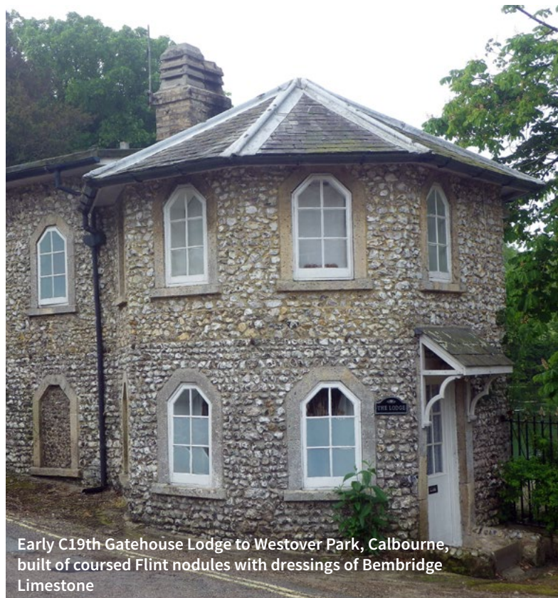
Early C19th Gatehouse Lodge to Westover Park, Calbourne, built of coursed Flint nodules with dressings of Bembridge Limestone

Field Flint is the main flint type represented within the flint-work of village cottages and farm buildings which sit on the Chalk outcrop in the inland parts of the Isle. Historically, the stone was collected directly from the field surfaces or from field brash. Field Flint is used in a variety of ways for walling; typically, pieces were selected for shape and size and were laid in either random or coursed patterns. A notable example of its use is in the early C19th Gatehouse Lodge at Calbourne.