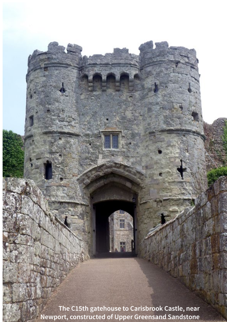
The C15th gatehouse to Carisbrooke Castle, near Newport, constructed of Upper Greensand Sandstone

The Upper Greensand Sandstone is a pale greenish-grey, fine-grained, glauconitic, calcareous or siliceous sandstone with spicular chert and small brownish phosphatic pebbles. It is often highly bioturbated, and contains a limited fossil fauna including serpulid worms, bivalves (scallops, oysters), ammonites and brachiopods. When weathered, the sandstones can become highly porous as the siliceous sponge spicules are gradually leached out and the stone surface flakes and spalls. The Upper Greensand Sandstone was the most important source of building sandstones on the Isle of Wight, and has been used since Roman times. It has seen extensive use at Shanklin (especially as ashlar, walling stone and as window dressings), Newchurch, Rew, Niton, Whitwell, Newport, Gatcombe, Wroxhall and Godshill. It is also the source of large ashlar and squared stone blocks for many houses in Ventnor, Bonchurch, St. Lawrence and Niton, as well as being employed in several historic and important buildings on the Isle including Appuldurcombe House, Arreton Manor, Yaverland Manor and Carisbrooke Castle.