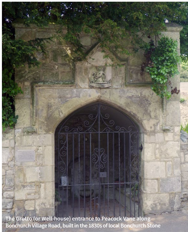
The Grotto (or Well-house) entrance to Peacock Vane along Bonchurch Village Road, built in the 1830s of local Bonchurch Stone

This is a massive, pale-grey to pale-buff coloured variety of Ventnor Stone which is only slightly glauconitic. It was quarried only at Bonchurch and saw mainly used as ashlar or roughly squared blocks in buildings and boundary walls in the Bonchurch and Ventnor area, and in some churches elsewhere on the Isle, for example at Freshwater.